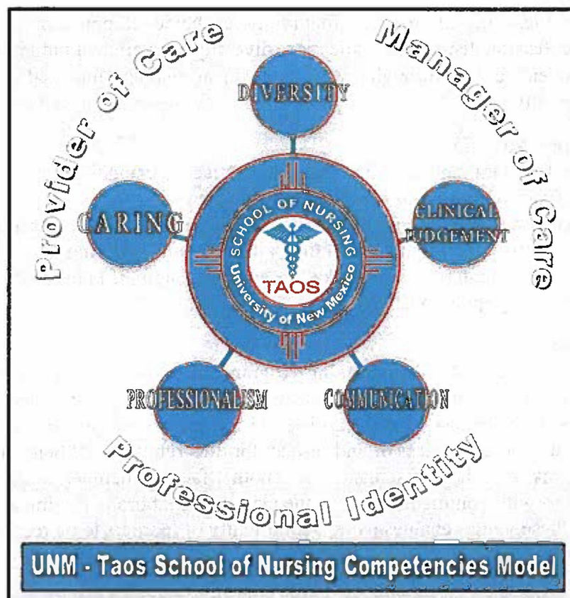
Exhibit 1. UNM-Taos Nursing Competencies Model